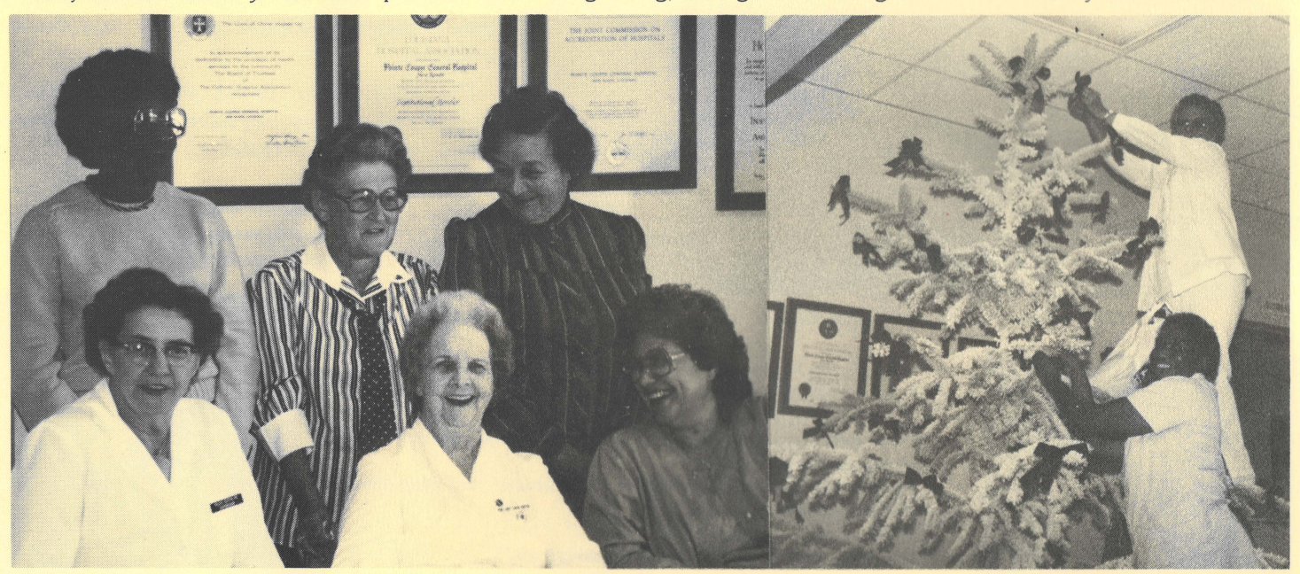
A few of our dedicated employees!

It's just one more way Pointe Coupee General is "Progressing, Caring and Growing" for the community. "Bonne Sante".