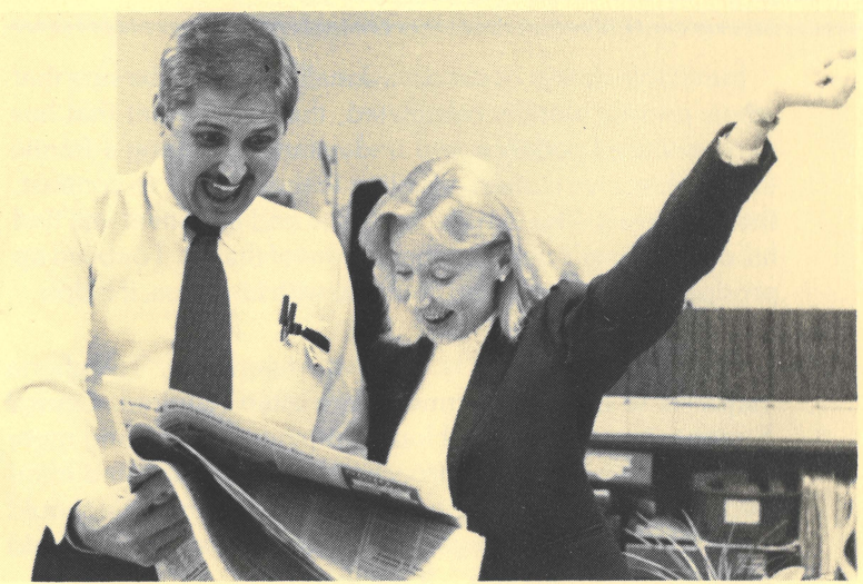
PASSING OF THE 1984 SALES TAX!