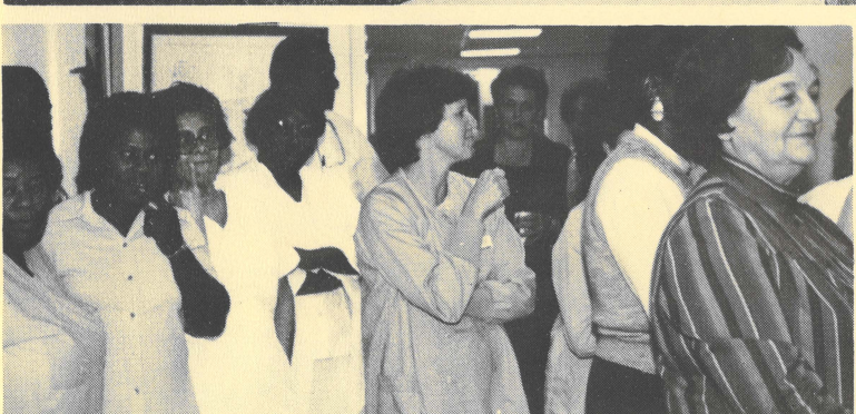
A habit is something you can do without thinking. Which is why most of us have so many of them.