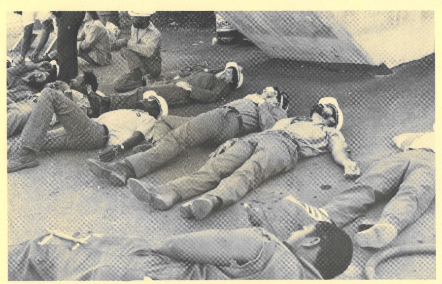
Cajun II Electric Mock Disaster Drill.

What put Americans in hospitals last year? According to an insurance study, circulatory system problems accounted for 21% of male patients while digestive disorders ranked second with 16%. Pregancy and childbirth caused 25% of all hospital stays for women. Another 10% of female patients received care for reproductive problems.